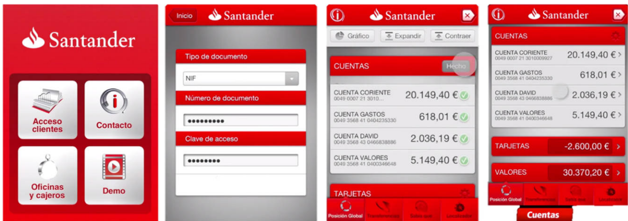
Figure 2 Video images shown to subjects.